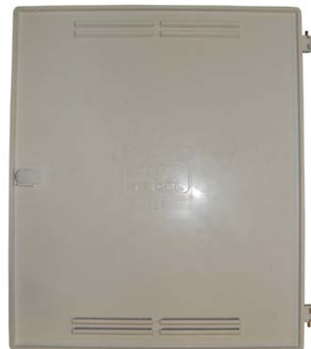
Example: gas door (uk standard mark 1 meter box)