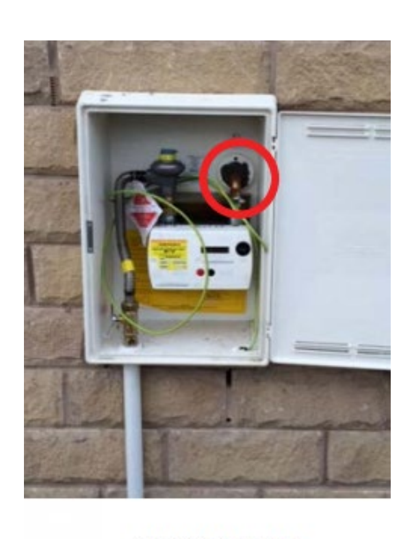
SPIGOT IN SITU