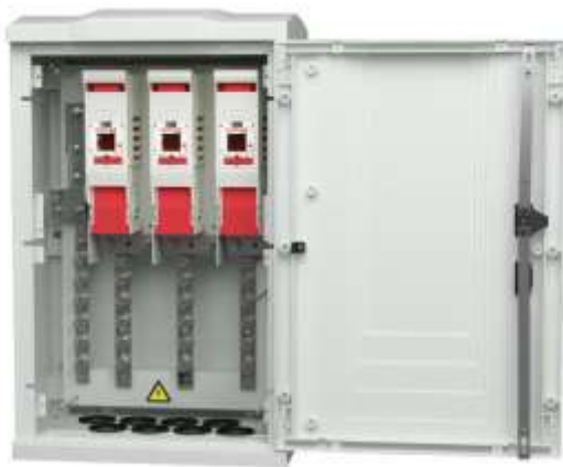
Example: distribution + protection board