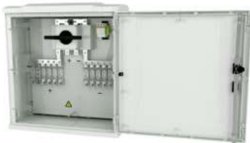
Example: photovoltaic nh-fuses