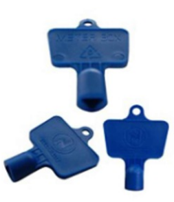
Spare key (170001)