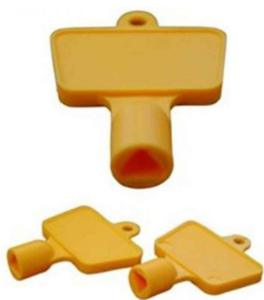
Spare key (170000)