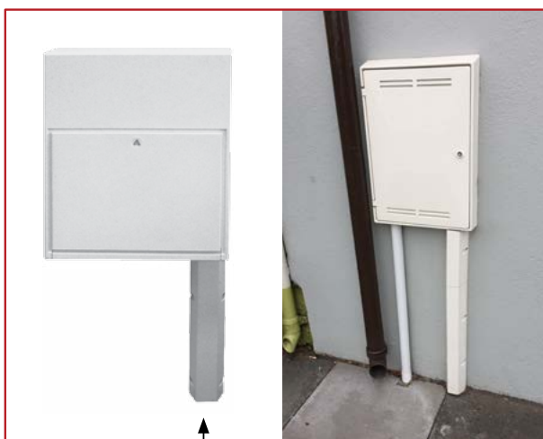
M250 (32mm Riser Pipe Cover)