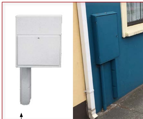
M249 (63mm Riser Pipe Cover)