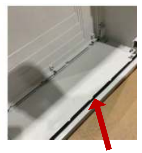
Ensure the tabs are covered