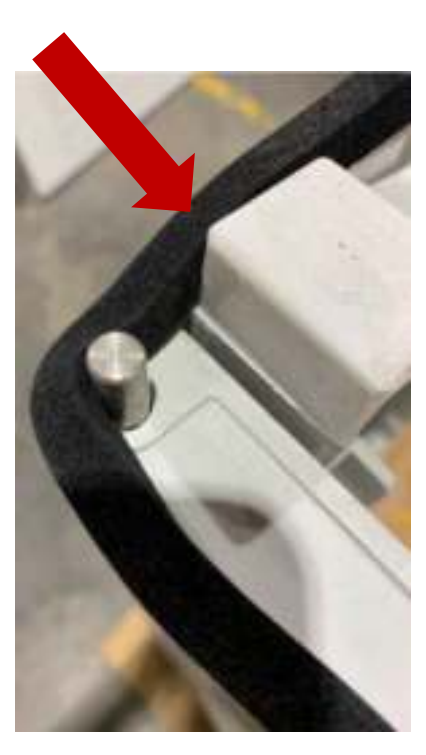
Cut at location indicated with arrow above if required