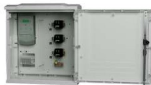
Example: electrical indirect metering