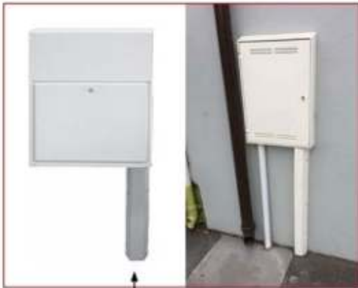
M250 (32mm Riser Pipe Cover)