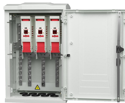
Example: distribution + protection board